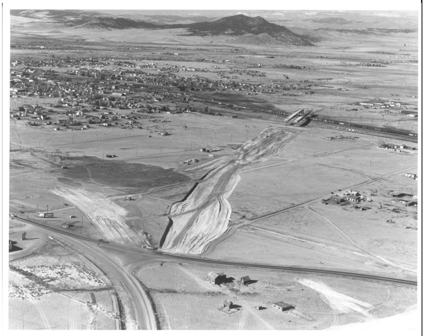
I-15 construction in Helena

Capital Carriages c/o Darrell Beckstrom 1737 5th Ave Helena MT 59601