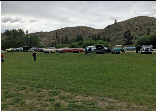
Friday night dinner near Hamilton.