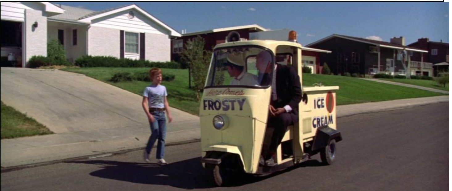
1960 Cushman Truckster