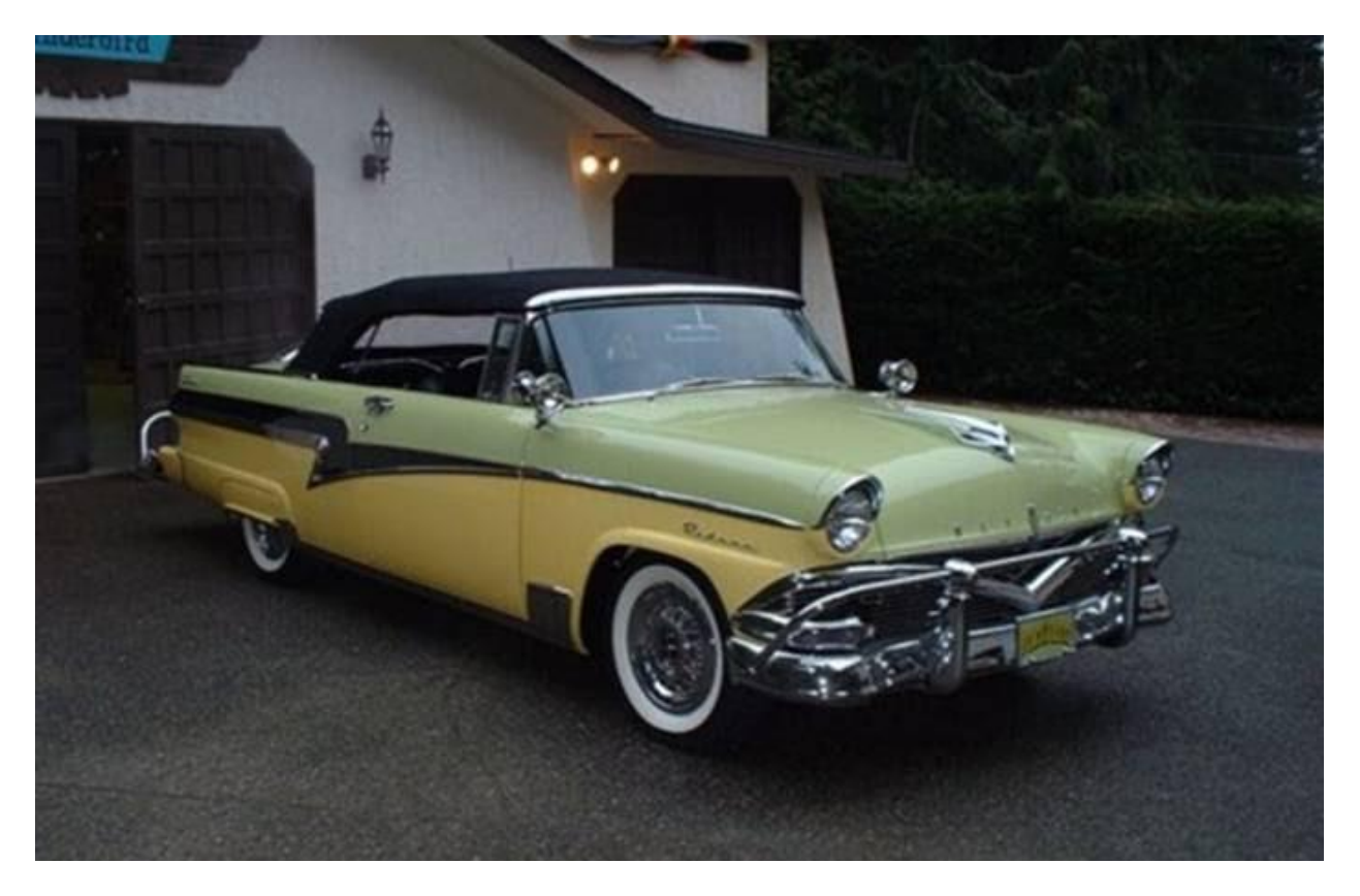
1956 Meteor Convertible

Meteors used some Mercury colors in 1956. This 56 Meteor is painted Grove Green and Saffron Yellow with a black lightning bolt and the production numbers are only 479.