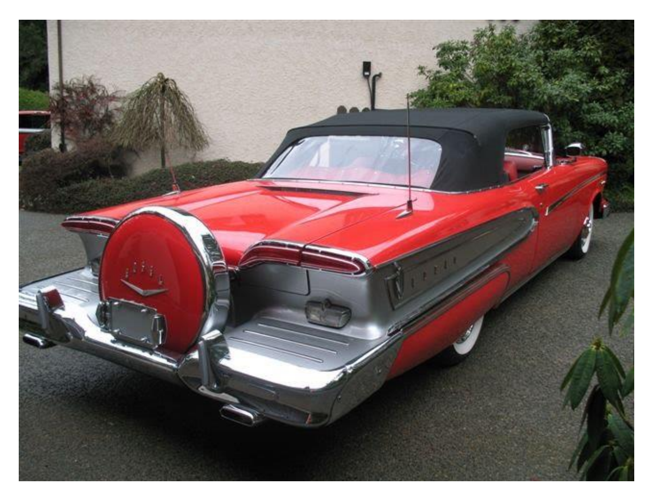
1959 Edsel Convertible

This is the latest addition to the Mountaintop Collection.