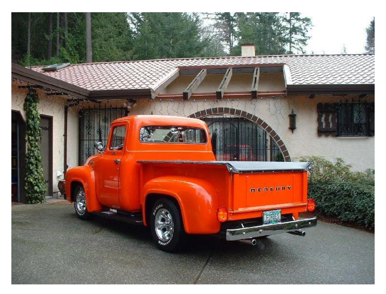
1956 Mercury M-100 Pickup

We have driven this truck all over the place form CA to Manitoba to Sturgis many times since we bought it in 1978.