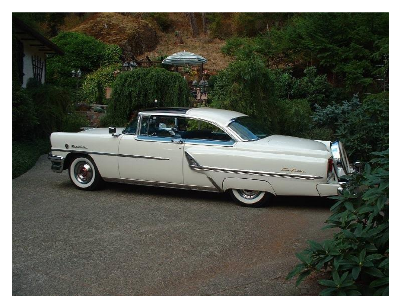
55 Mercury Sun Valley

I bought this car from an old ladies estate sale in 1983. It was rust free but pretty banged up with only 26,000 miles on it.