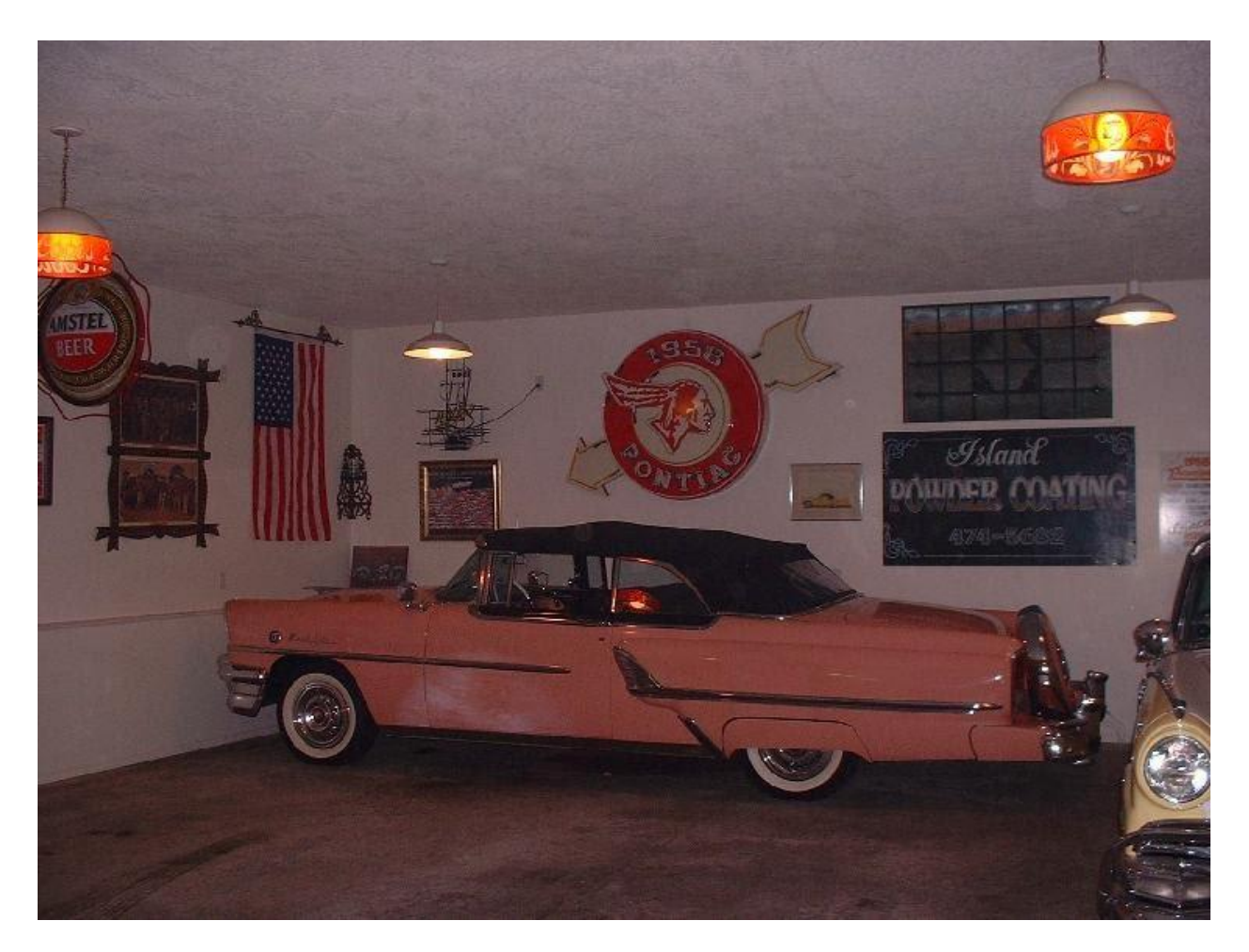
1955 Mercury Convertible

I tow barred this car from Southern CA in 1989 behind my little Ford short box 302. The 55 was so ugly, not once did anyone give me the "thumbs up".