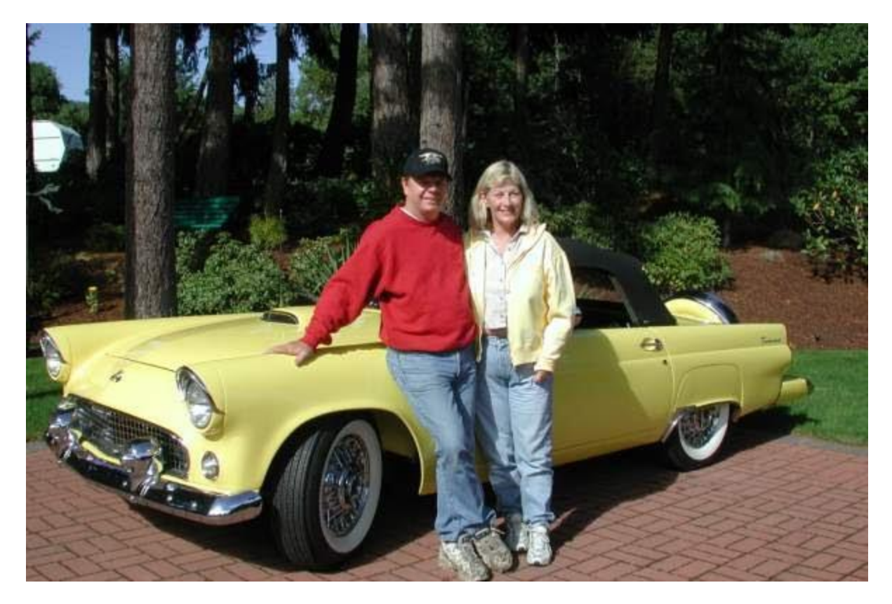
1956 Ford Thunderbird