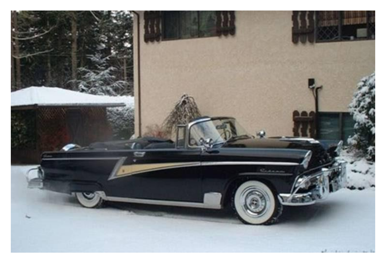
1955 Meteor Convertible

This car is mostly original and it has taken me 28 years to buy it from the original owner. This car spent a good part of its life in Winnipeg.